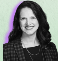
REP. MAGGIE NURRENBERN SENATE DISTRICT 17