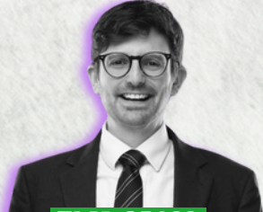
ELAD GROSS ATTORNEY GENERAL