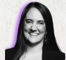
REP. BETSY FOGLE HOUSE DISTRICT 135