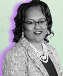
SEN. BARBARA ANNE WASHINGTON SENATE DISTRICT 9