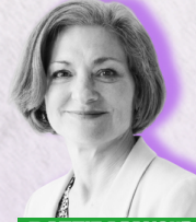
PATTIE MANSUR HOUSE DISTRICT 25