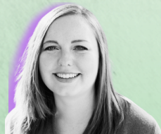
REP. BRIDGET WALSH MOORE HOUSE DISTRICT 93