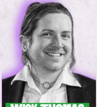
WICK THOMAS HOUSE DISTRICT 19