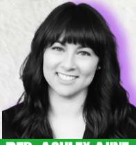
REP. ASHLEY AUNE HOUSE DISTRICT 14