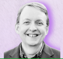
REP. KEMP STRICKLER HOUSE DISTRICT 34