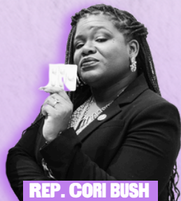
REP. CORI BUSH