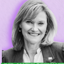
REP. KATHY STEINHOFF HOUSE DISTRICT 45