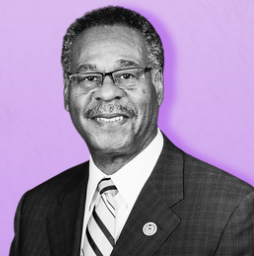
REP. EMMANUEL CLEAVER II