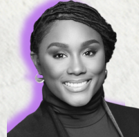
REP. RAYCHEL PROUDIE HOUSE DISTRICT 73