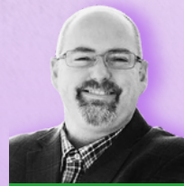
REP. ADRIAN PLANK HOUSE DISTRICT 47