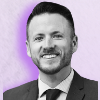
REP. AARON CROSSLEY HOUSE DISTRICT 29