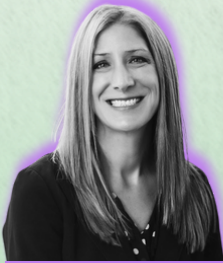
REP. PATTY LEWIS SENATE DISTRICT 7