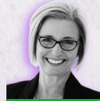
REP. STEPHANIE HEIN HOUSE DISTRICT 136