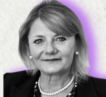
REP. LADONNA APPELBAUM HOUSE DISTRICT 71