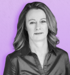
MAYOR MISSI HESKETH