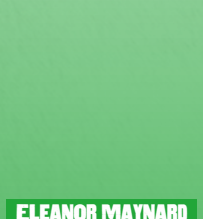
ELEANOR MAYNARD HOUSE DISTRICT 109