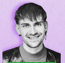
JOE JEFFERIES HOUSE DISTRICT 48