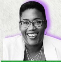
REP. JAMIE JOHNSON HOUSE DISTRICT 12