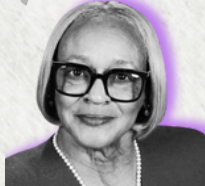
REP. MARLENE TERRY HOUSE DISTRICT 66