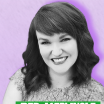
REP. KERI INGLE HOUSE DISTRICT 35